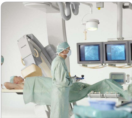
Minimal invasive medical intervention needing real-time complex image processing

HiPiP is setting out to obtain high throughput image processing of often very large and heterogeneous data sets. The project is addressing the demand for shorter image-processing times in three main areas: detailed brain imaging, minimal invasive surgery and faster operation of high resolution instruments. The main users of the technology will be companies that need fast and affordable complex image processing. Success will have a major impact on their offering to clients who will be able to get more informative data readily from their images.